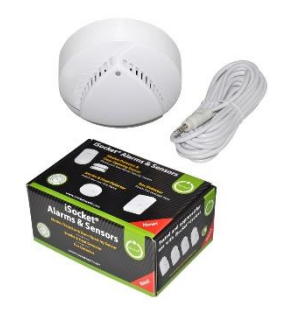
KIT2/KIT3 for fire alarm